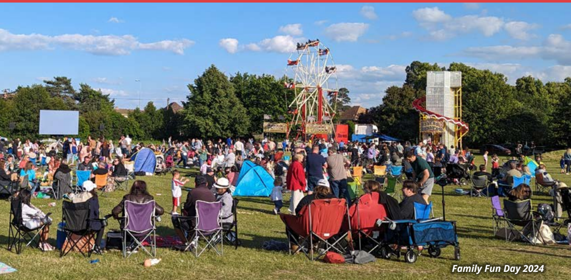
Family Fun Day 2024