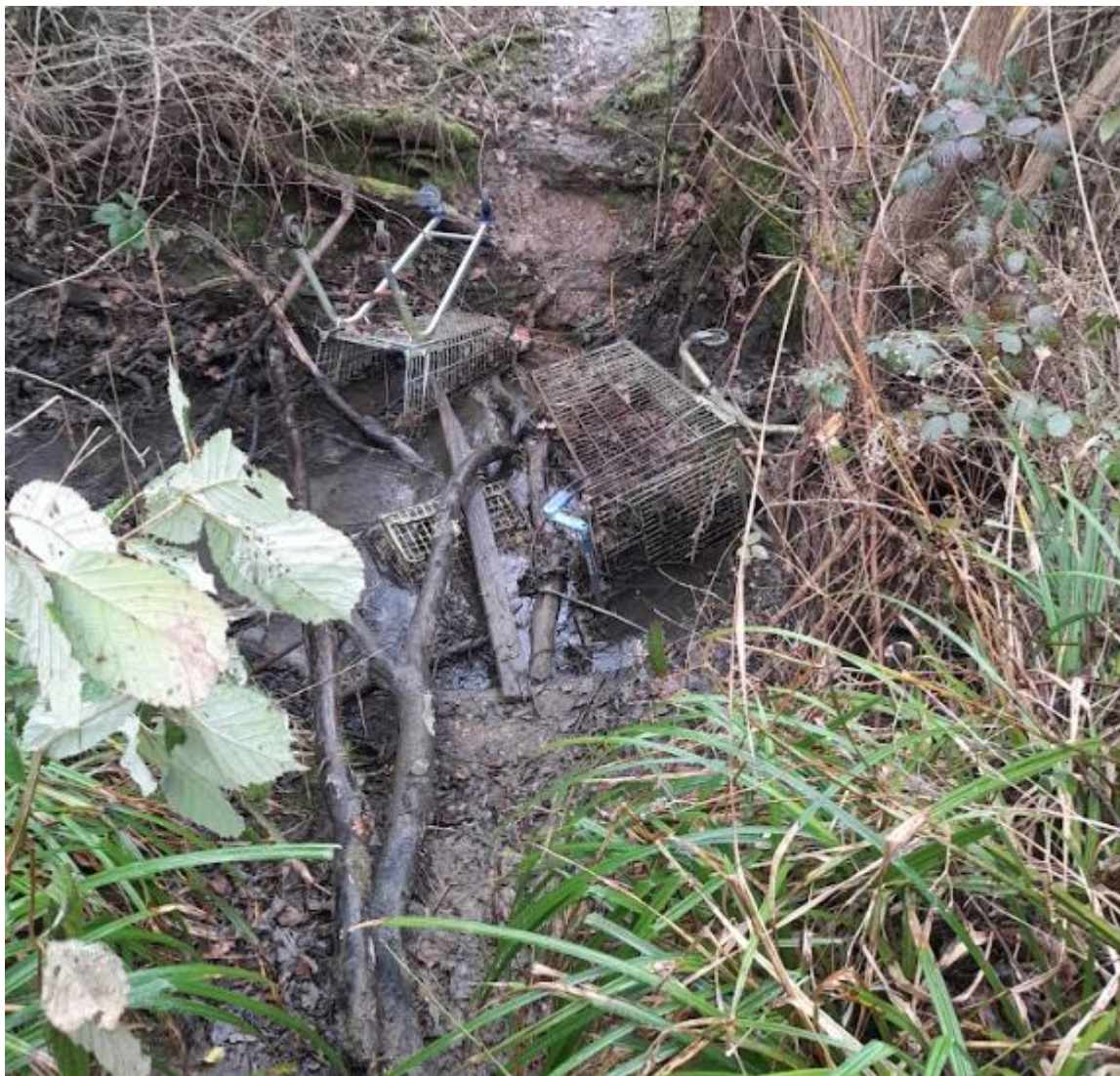
Photo 3. An ad-hoc crossing point from land owned by Central Bedfordshire Council created in the drainage ditch, resulting in partial blockage. The direction of water flow is from left to right.