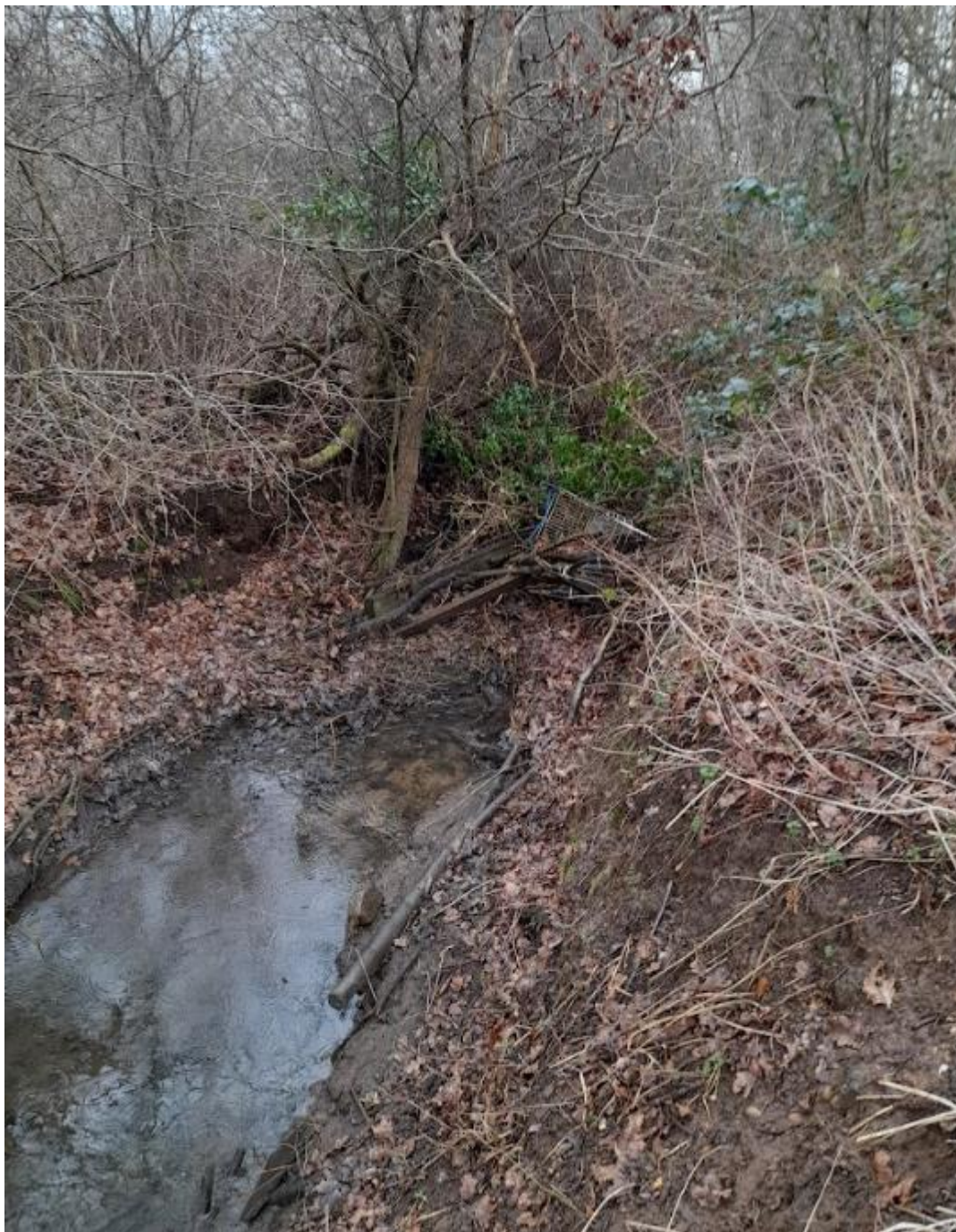
Photo 6. General vegetation blockage in the ditch. The direction of water flow is from the bottom left towards the centre of the photograph.