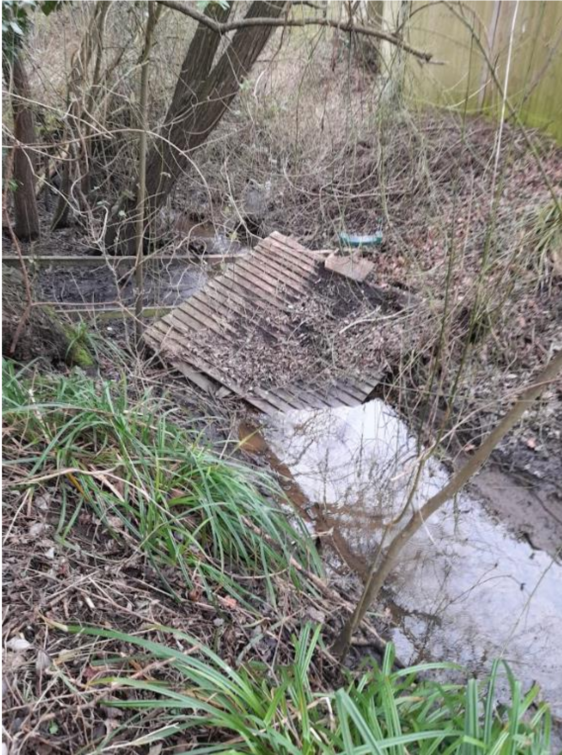
Photo 5. General waste, possible storm damage or fly tipping at a location in the drainage ditch. The direction of water flow is upper left to bottom right of the photograph.