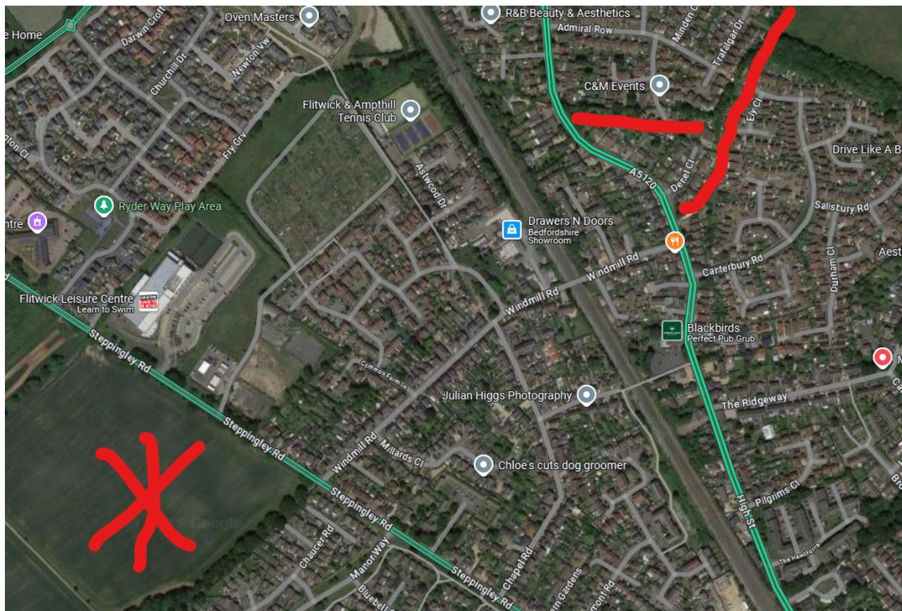
Photo 1. The red lines are drainage ditches which take water from the North West area of Flitwick towards the River Flit. The large RED asterisk is the area proposed for the development.