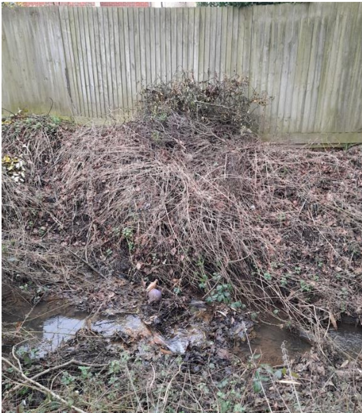
Photo 4. An example of garden waste being fly tipped from a property into the ditch, and it appears that earlier tips of waste have fallen into the ditch.