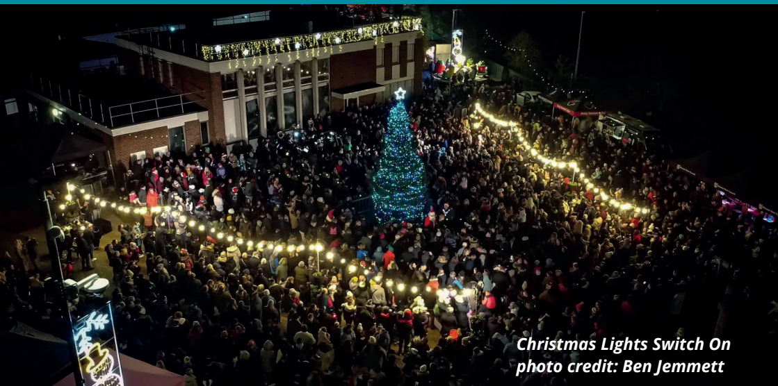
Christmas Lights Switch On