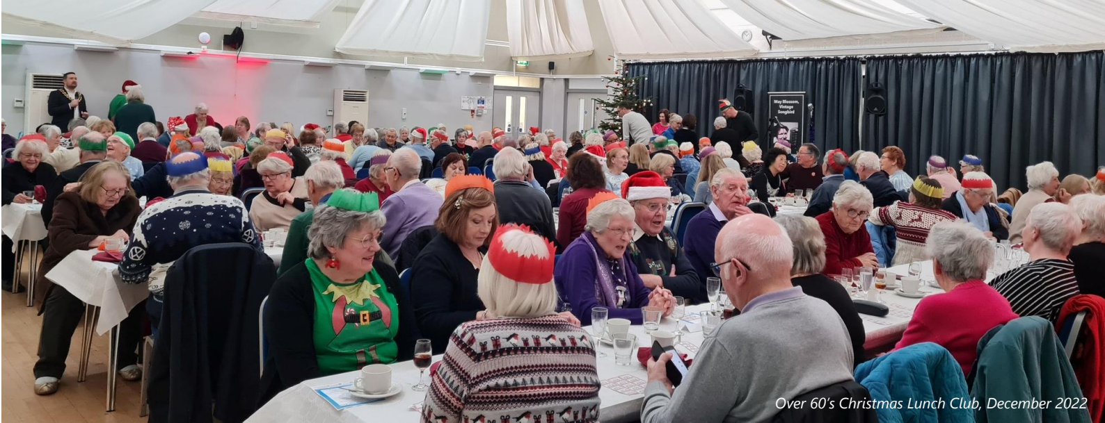
Over 60's Christmas Lunch Club, December 2022