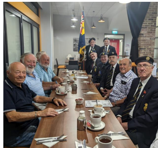
Members of the Royal British Legion, Flitwick & District Branch enjoy their monthly breakfast at the Rendezvous Café & Bar

The economic outlook and possible impacts on the business this financial year are very concerning, especially for businesses operating in the hospitality sector. Still, we remain in a solid financial position and are confident that our business strategy will continue to deliver positive outcomes for the people of Flitwick.