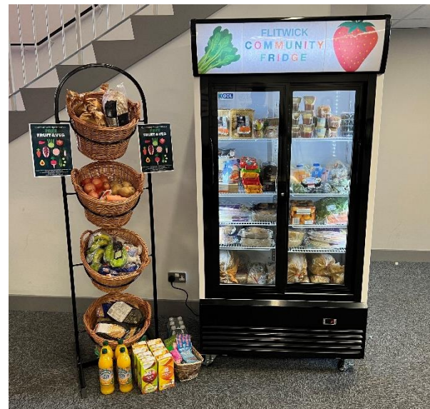
Flitwick Community Fridge at The Rufus Centre

The reality is that after three years of seeking out efficiencies, little more can be trimmed from the budget without implementing significant cuts to the services and events we provide. That said, Staff and Councillors have worked together over the last three months to deliver efficiencies of over £50,000 as part of the budget process.