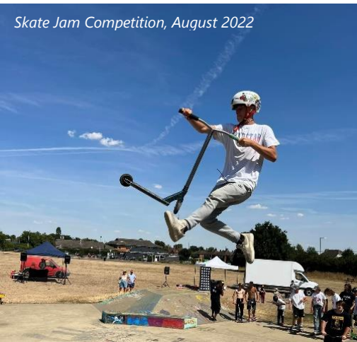
Skate Jam Competition, August 2022

Our Public Realm Team has worked hard to maintain our parks and open spaces taking on tasks ranging from managing the Grade II listed Manor Park to maintaining playgrounds, mowing, planting and dealing with litter. We are also thrilled to see the opening of a new circular walk in Manor Park, reinstated after 100 years by the Flitwick P3 Volunteers and our Public Realm Team.