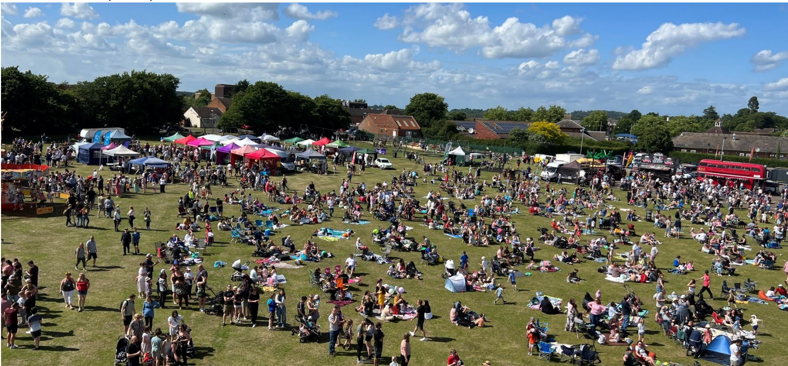
Flitwick Family Fun Day, Millennium Park, June 2022