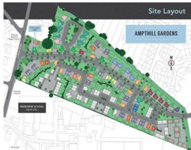
Image 3.3 Poppy Drive, Ampthill