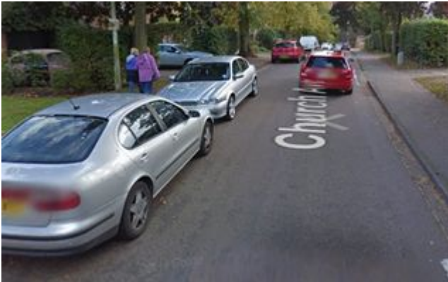
Image 3.4 below is Church Avenue in Ampthill

Many of our streets are blocked up with cars – whether they belong to residents, commuters or visitors. Parked cars can be a danger for other road users and for pedestrians especially wheelchair users and pushchairs. Crossing between parked cars on Oliver Street and Dunstable Street in Ampthill is hazardous. The school crossing patrol site in Ampthill has visibility issues due to parked vehicles. Vehicles parked on footways create significant difficulties, often forcing pedestrians to walk on the road.