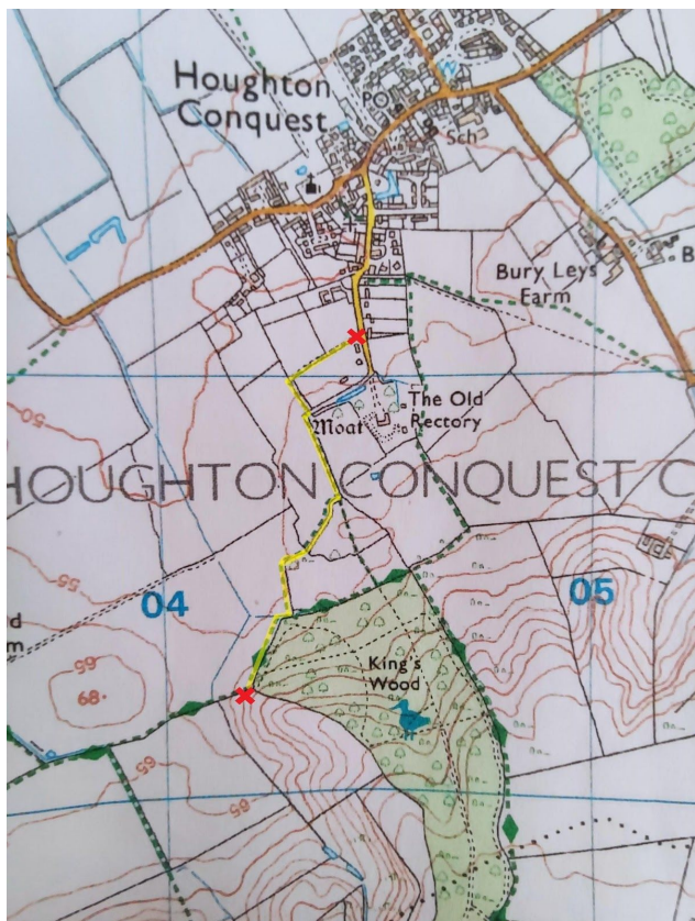
Figure 2: OS Map with highlighted trail