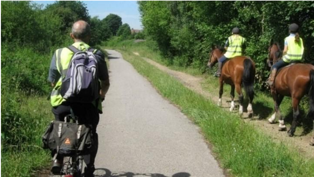
Figure 3: What the trail could look like