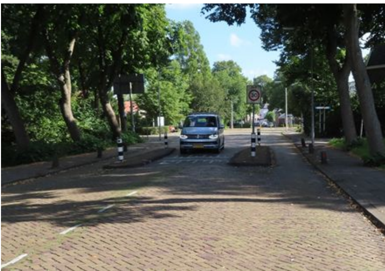
Image 3.4 – an example of a street with car management: squeeze the car not the cyclist or pedestrian

There are solutions, with parking managed successfully in many areas of Fliwick for example, by timed parking restrictions. Better infrastructure can help.