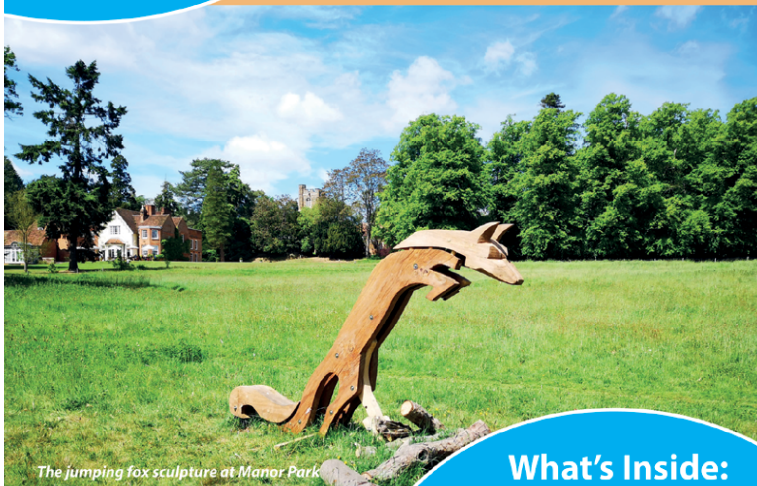
The jumping fox sculpture at Manor Park

Flitwick Town Council The Rufus Centre Steppingley Road Flitwick Bedford MK45 1AH