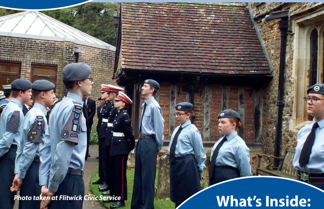
Photo taken at Flitwick Civic Service

Flitwick Town Council The Rufus Centre Steppingley Road Flitwick Bedford MK45 1AH