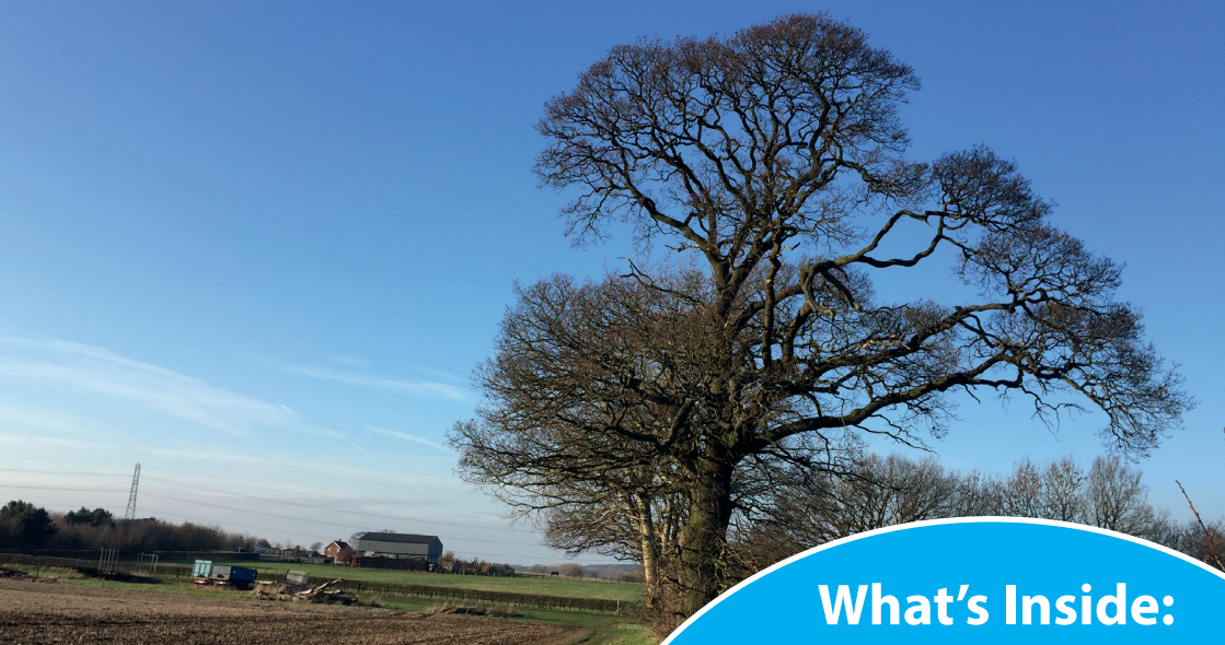
Photo of the fields adjoining Flitwick Woods

Flitwick Town Council The Rufus Centre Steppingley Road Flitwick Bedford MK45 1AH